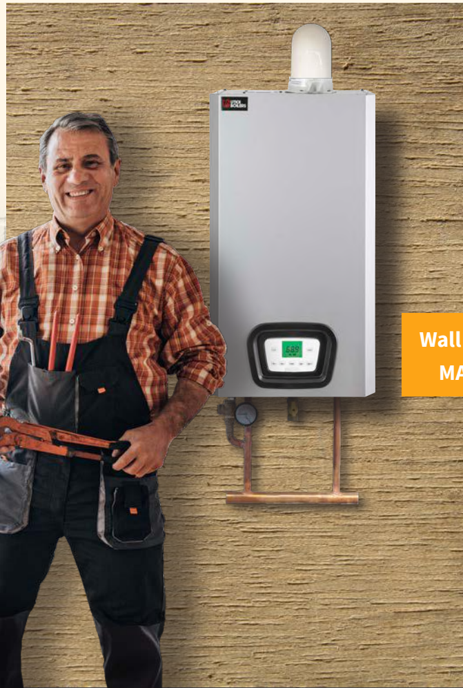
Wall Mounted MAC/MAH