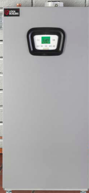
Floor Standing MACF/MAHF